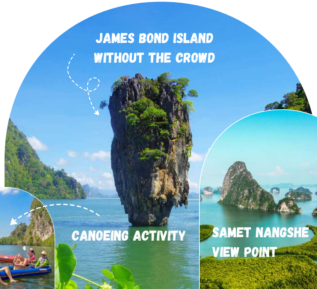
JAMES BOND ISLAND WITHOUT THE CROWD