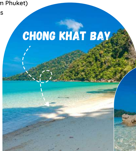
CHONG KHAT BAY