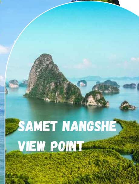
SAMET NANGSHE VIEW POINT