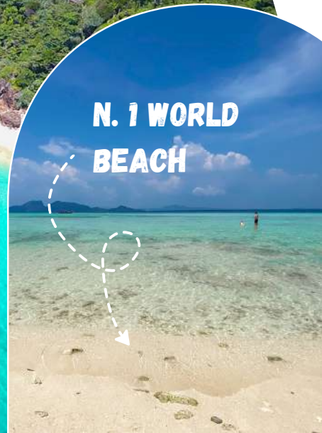
N. 1 WORLD BEACH